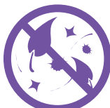
Eliminates volatile organic compounds (VOCs)