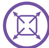
Purifies up to: 4,000 sq.ft.