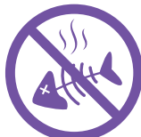
Eliminates odors and chemical contaminants